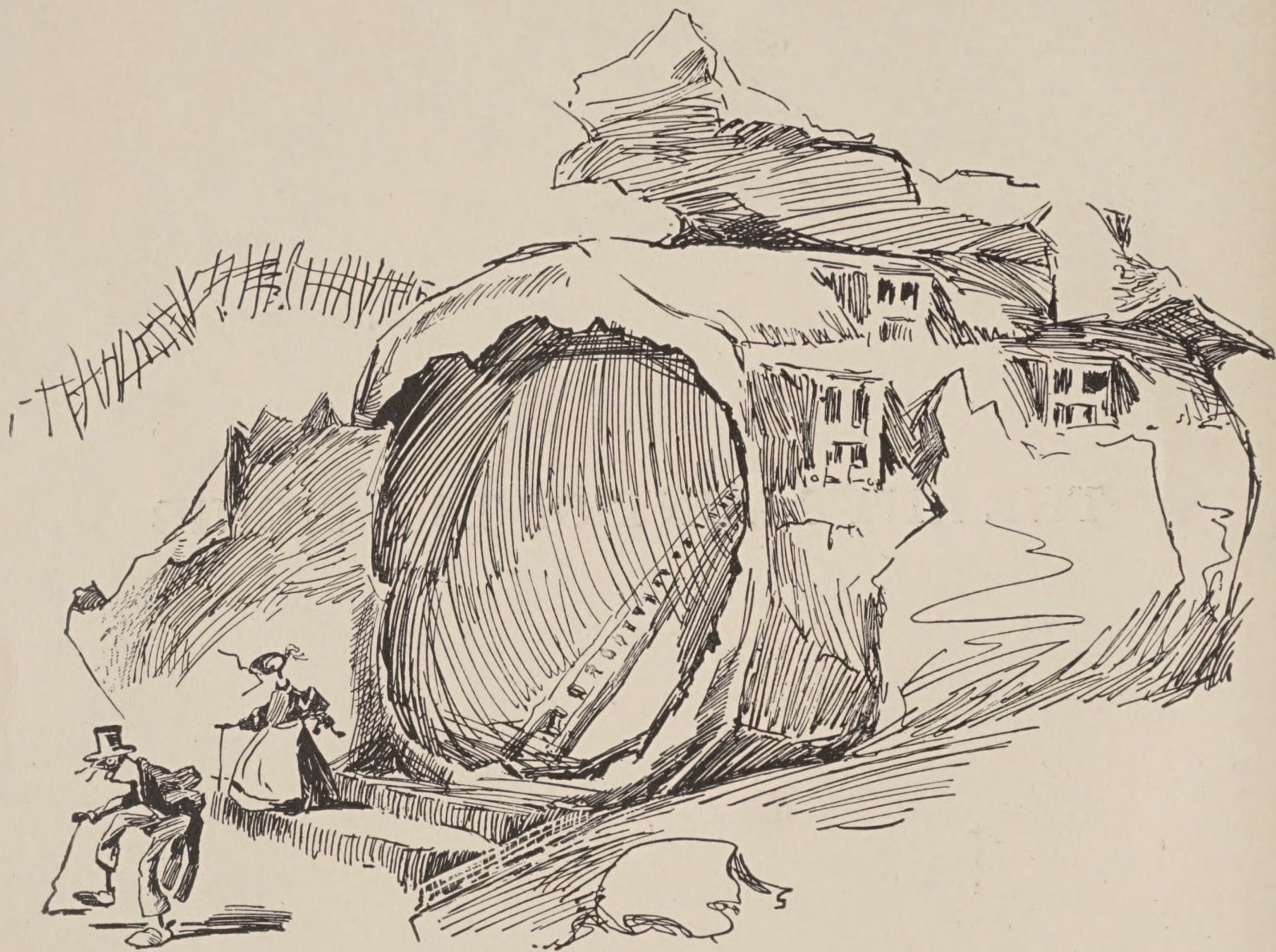
THE ANT'S AUNT SCOLDS THE ANT'S UNCLE.